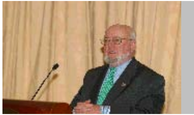
Thomas Keneally speaks at the dinner

T he Eritrean Development Foundation organized a 600-person gala benefit dinner that raised over $130,000 for immediate drought relief in Eritrea. The dinner was held on May 22, 2003 at Capital Hilton Hotel in Washington, DC. Acclaimed Australian author, Thomas Keneally, became the Fred Hollows Award recipient, acknowledging his exemplary artistic and humanitarian contributions to the development of Eritrea.